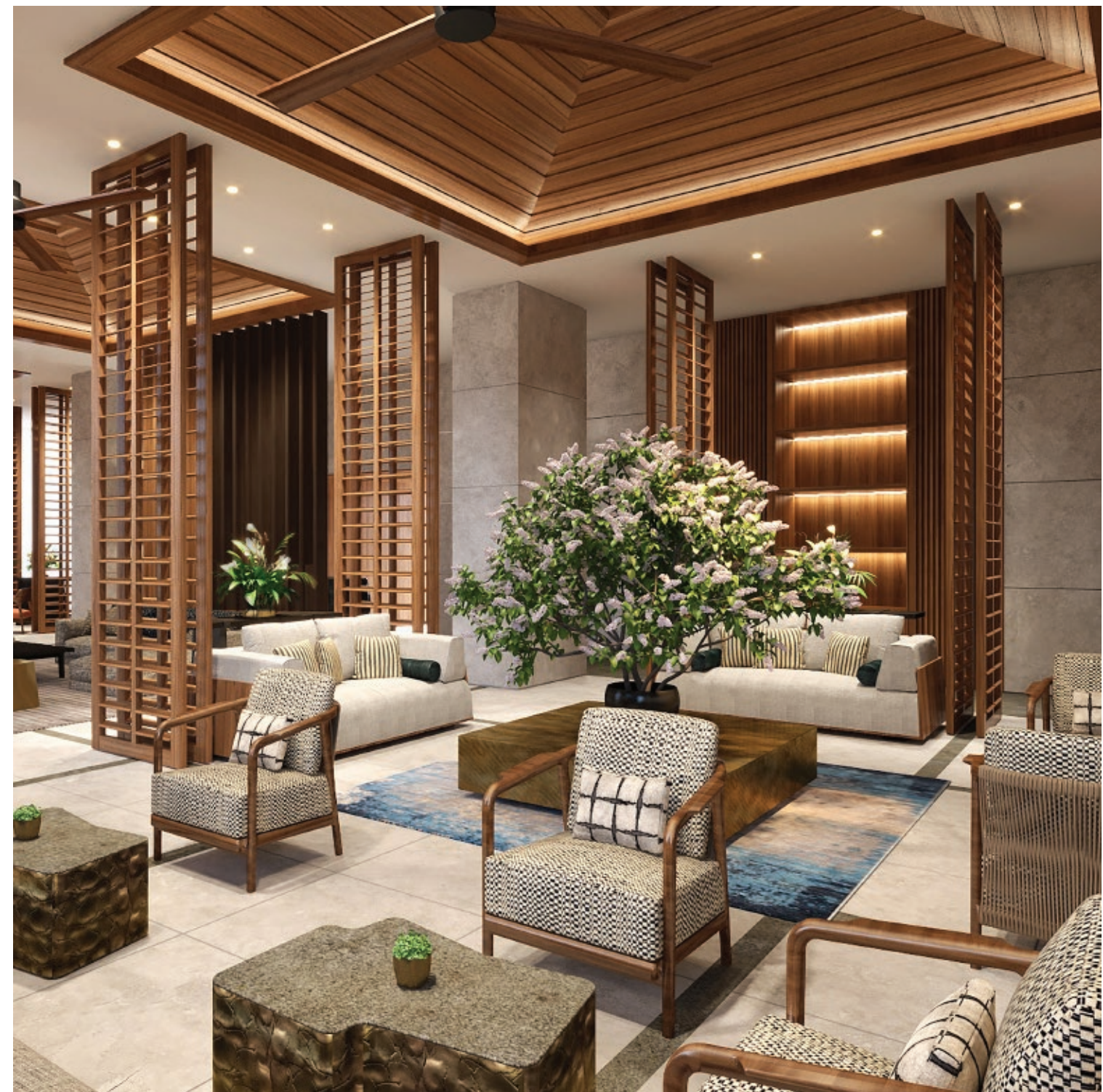
The Lounge. Artists' image for illustration purposes only.

Shang Residences at Wack Wack was designed with families in mind. The Kids Zone offers an exciting space for toddlers and young children to stretch their legs and explore their world.