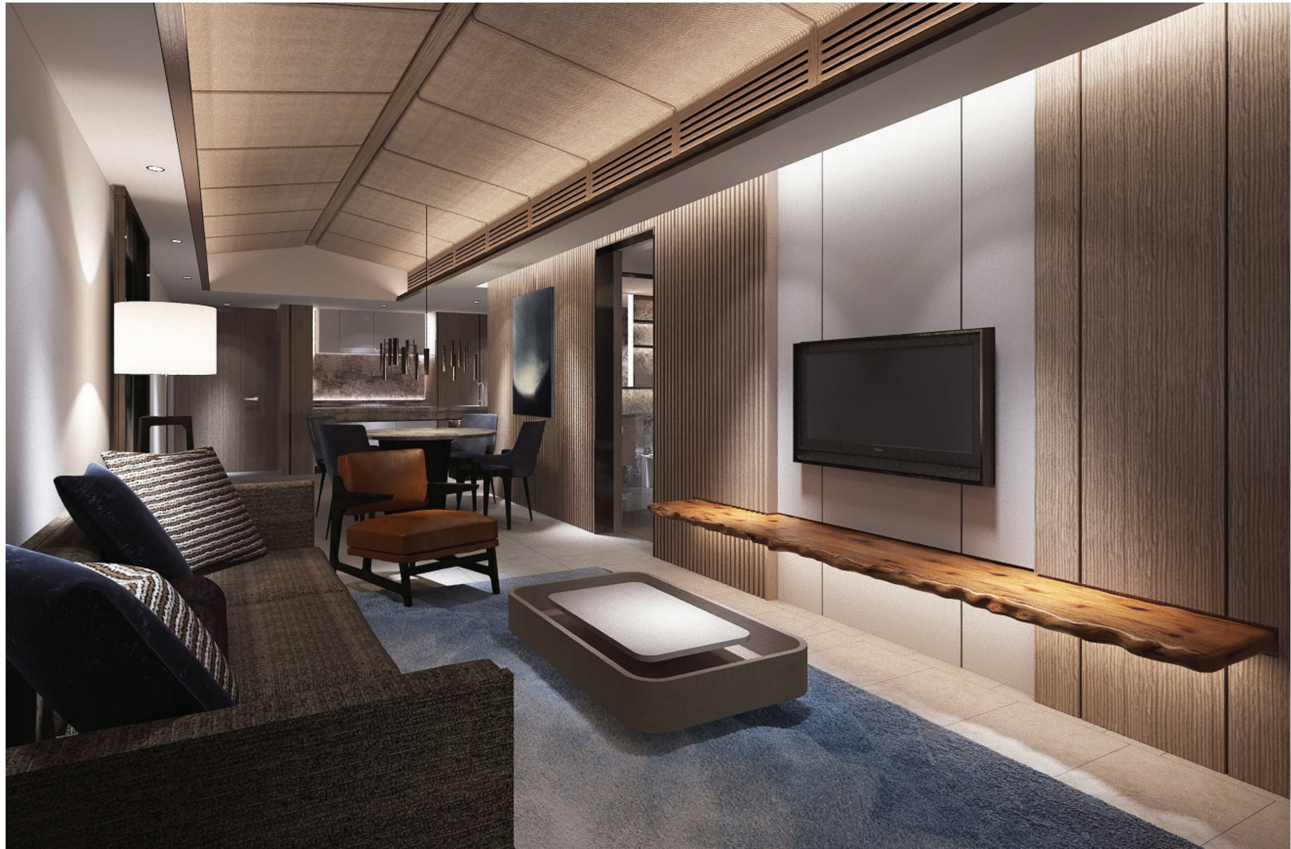
1 Bedroom unit Living Room. Artists' image for illustration purposes only.