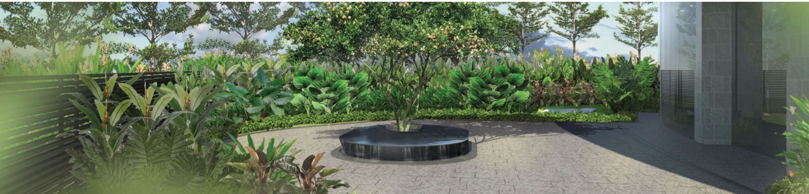
Driveway entrance. Artists' image for illustration purposes only.