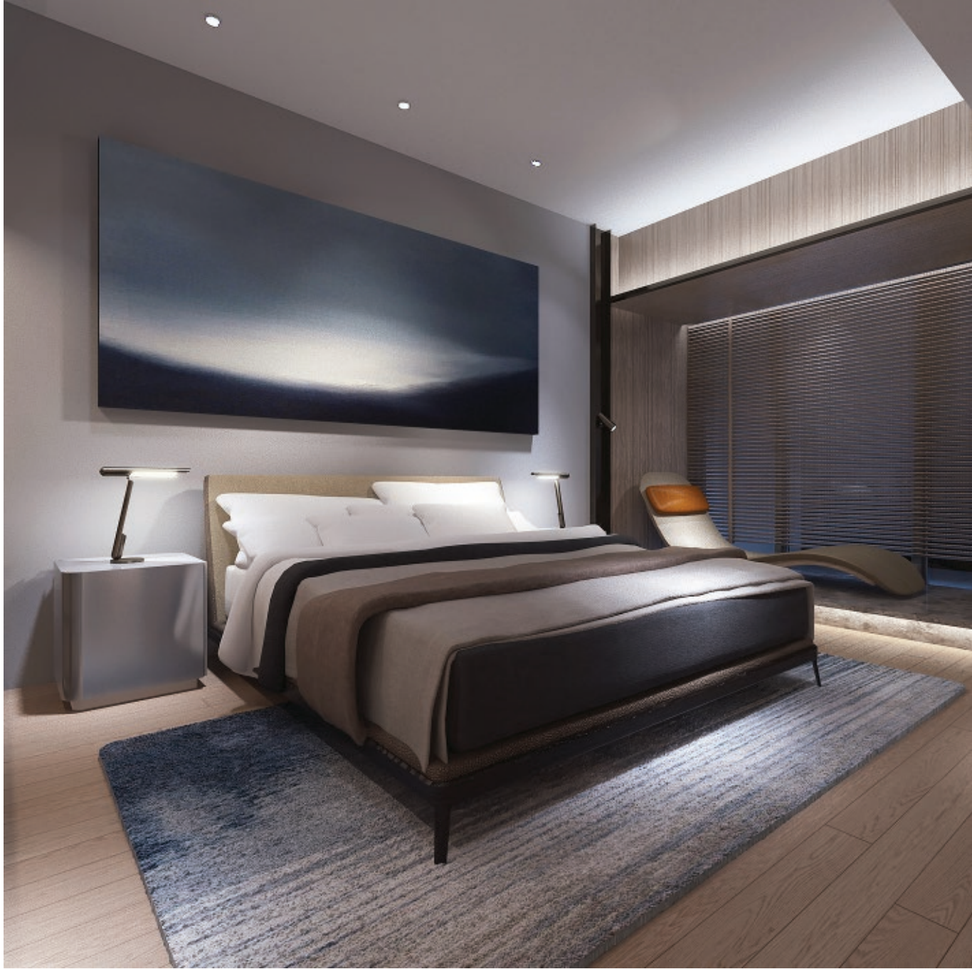
1 Bedroom unit Master Bedroom. Artists' image for illustration purposes only.