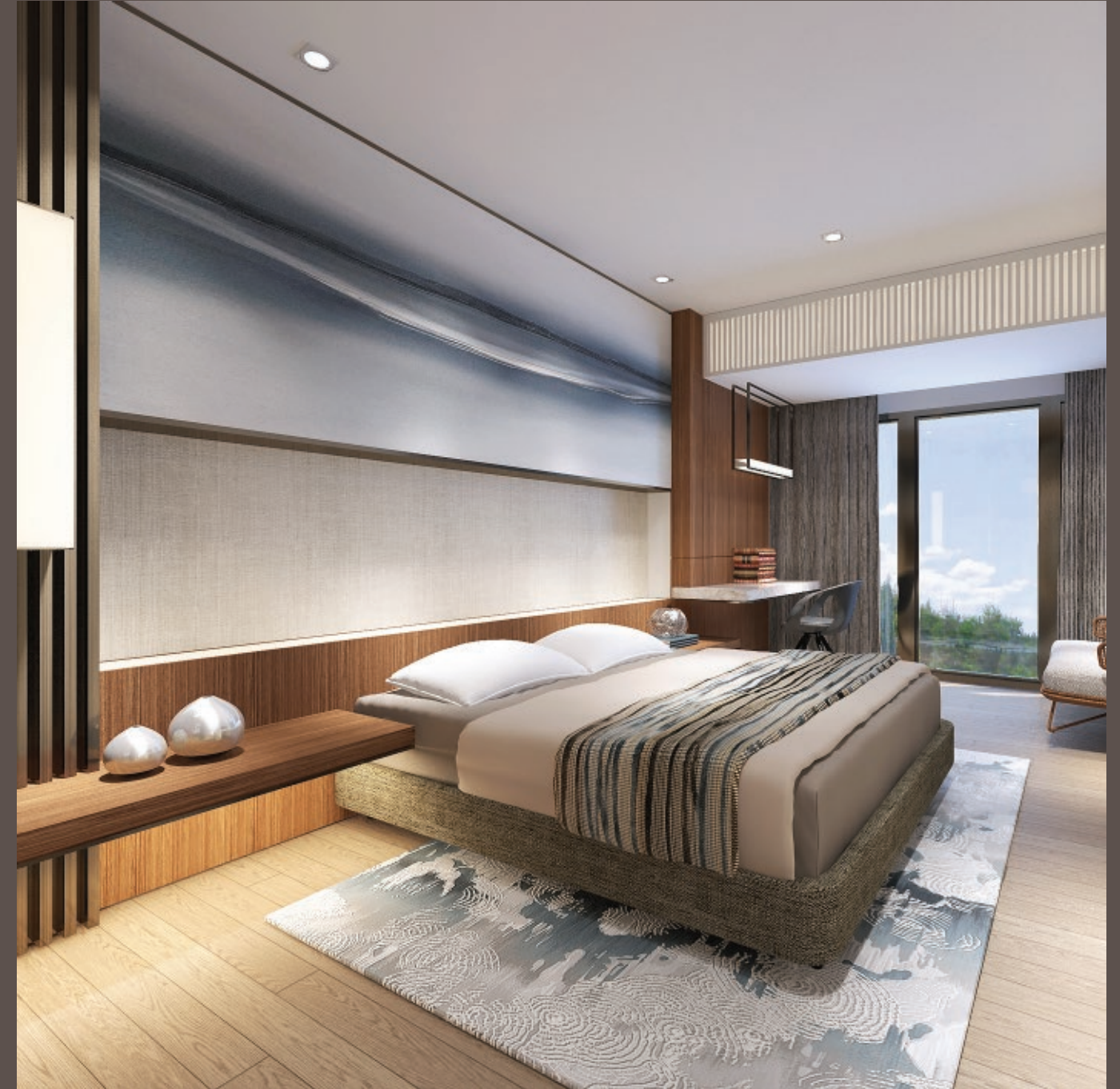
2 Bedroom unit Master Bedroom. Artists' image for illustration purposes only.