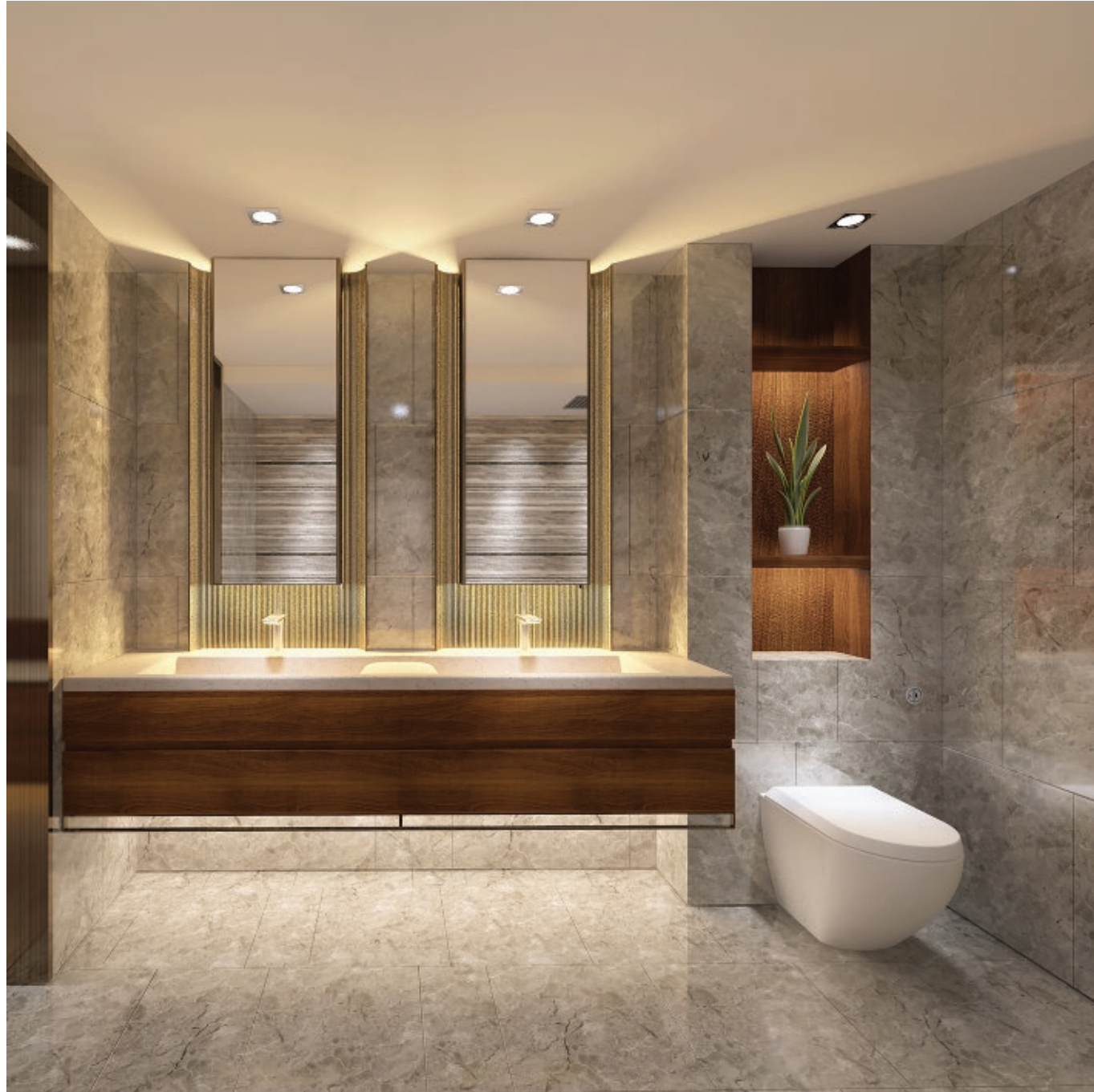
2 Bedroom unit Master Bathroom. Artists' image for illustration purposes only.