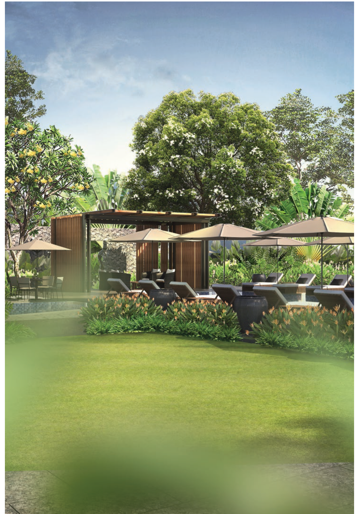
Garden. Artists' image for illustration purposes only.

Drawing inspiration from contemporary tropical luxury resorts - where it is as much about warm, thoughtful, and impeccable service as it is about carefully-crafted, meticulously designed details - our vision is to create homes that people feel innately drawn to, coupled with magnificent, unobstructed views over Wack Wack Golf & Country Club . Shang Residences at Wack Wack is your home in the city to unwind, contemplate, and rejuvenate.