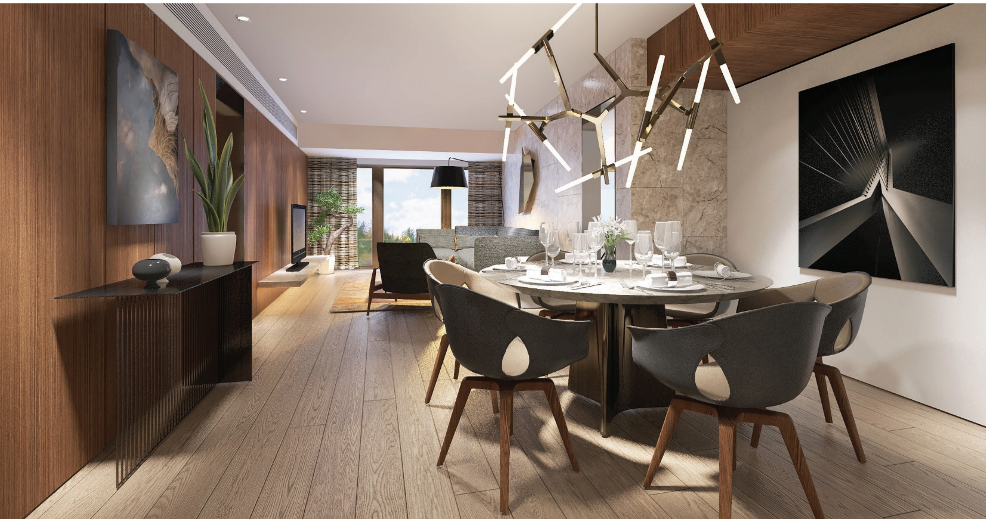
2 Bedroom unit Dining + Living Room. Artists' image for illustration purposes only.