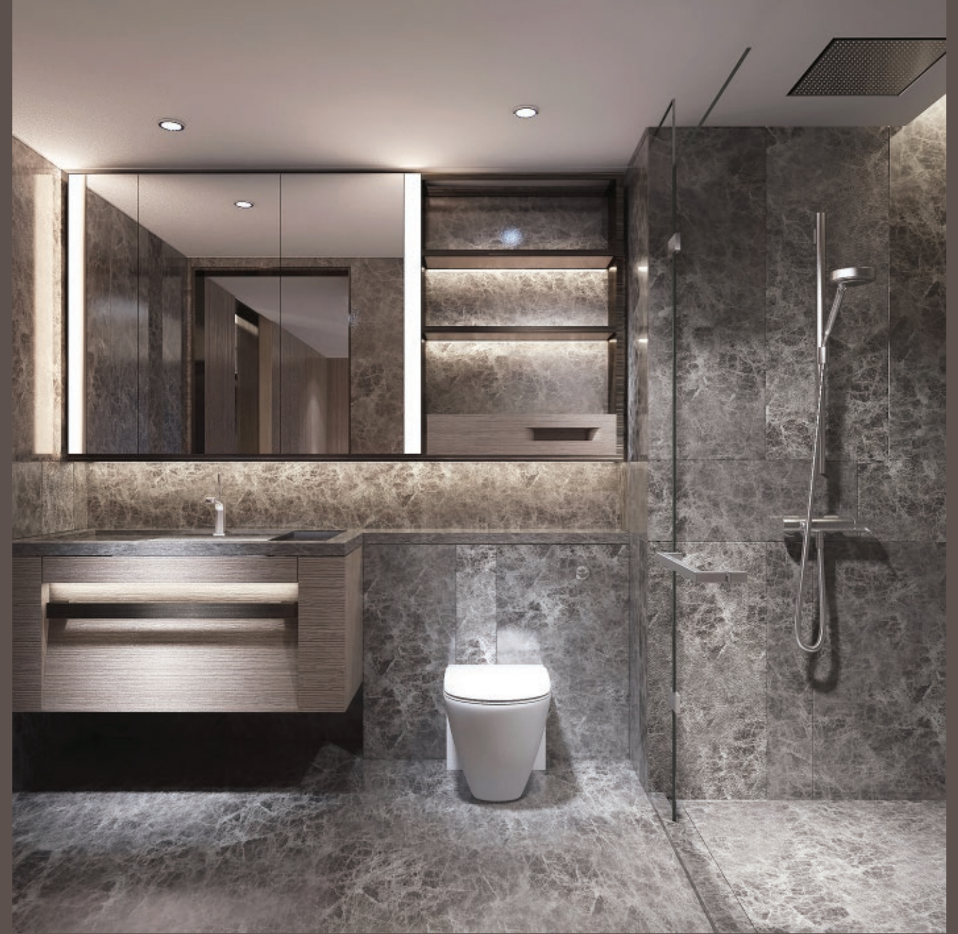
1 Bedroom unit Master Bathroom. Artists' image for illustration purposes only.