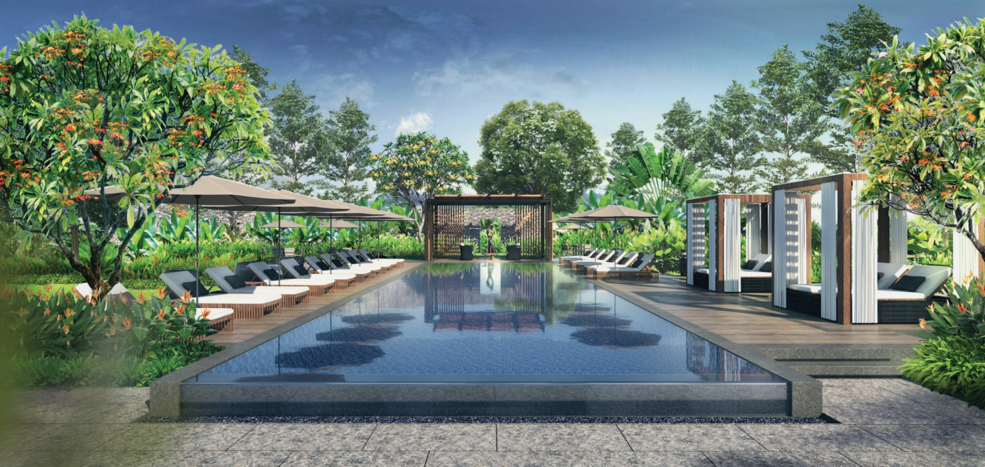
Pool area. Artists' image for illustration purposes only.