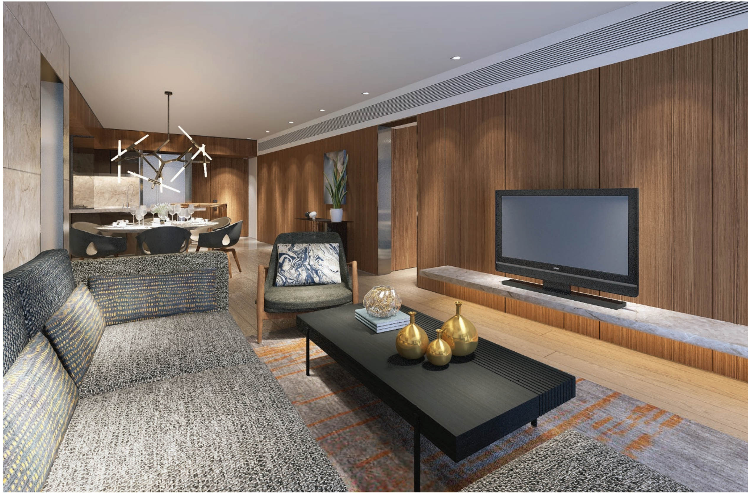
2 Bedroom unit Living Room. Artists' image for illustration purposes only.