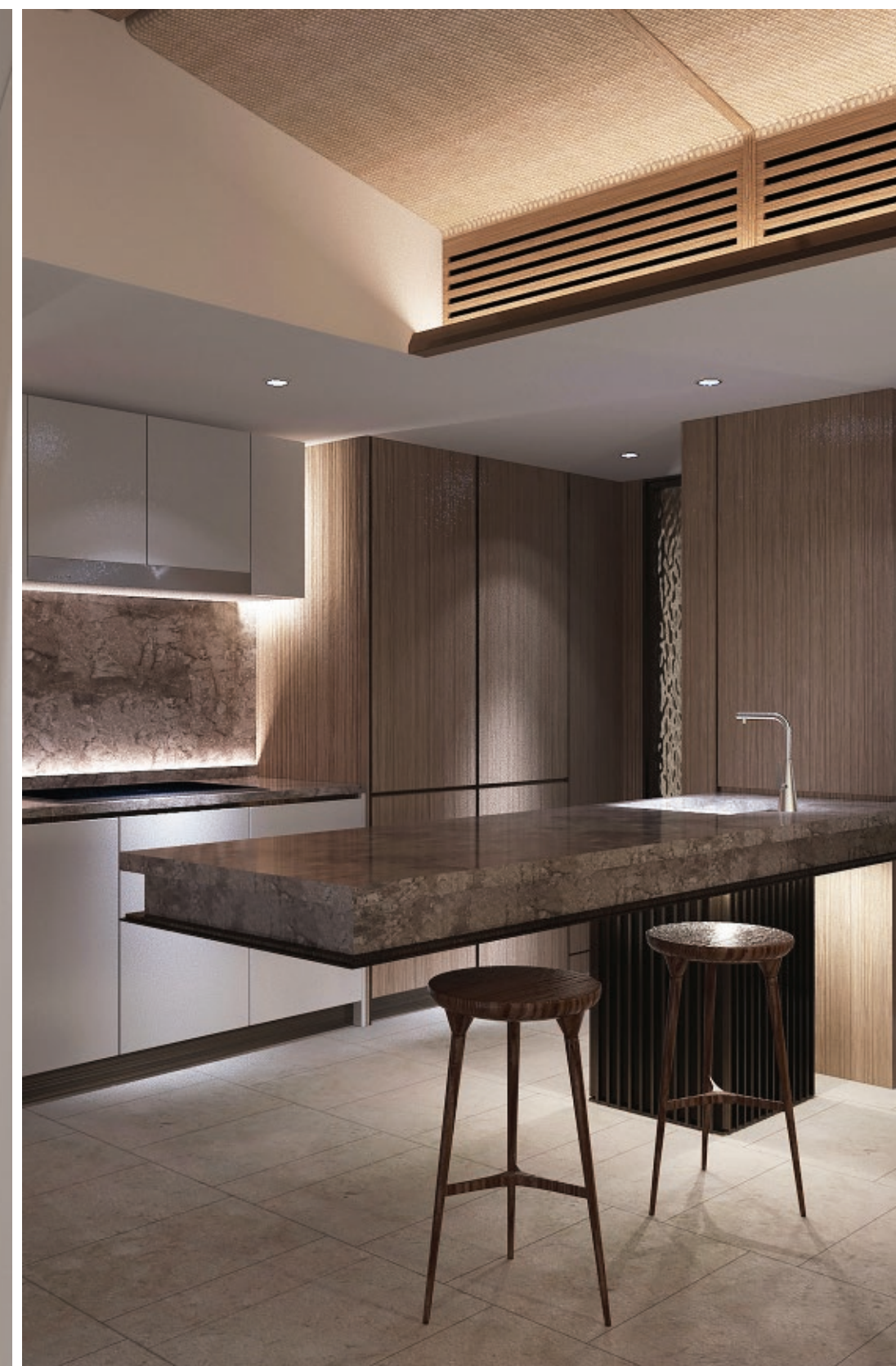
1 Bedroom unit Kitchen area + Living Room. Artists' image for illustration purposes only.