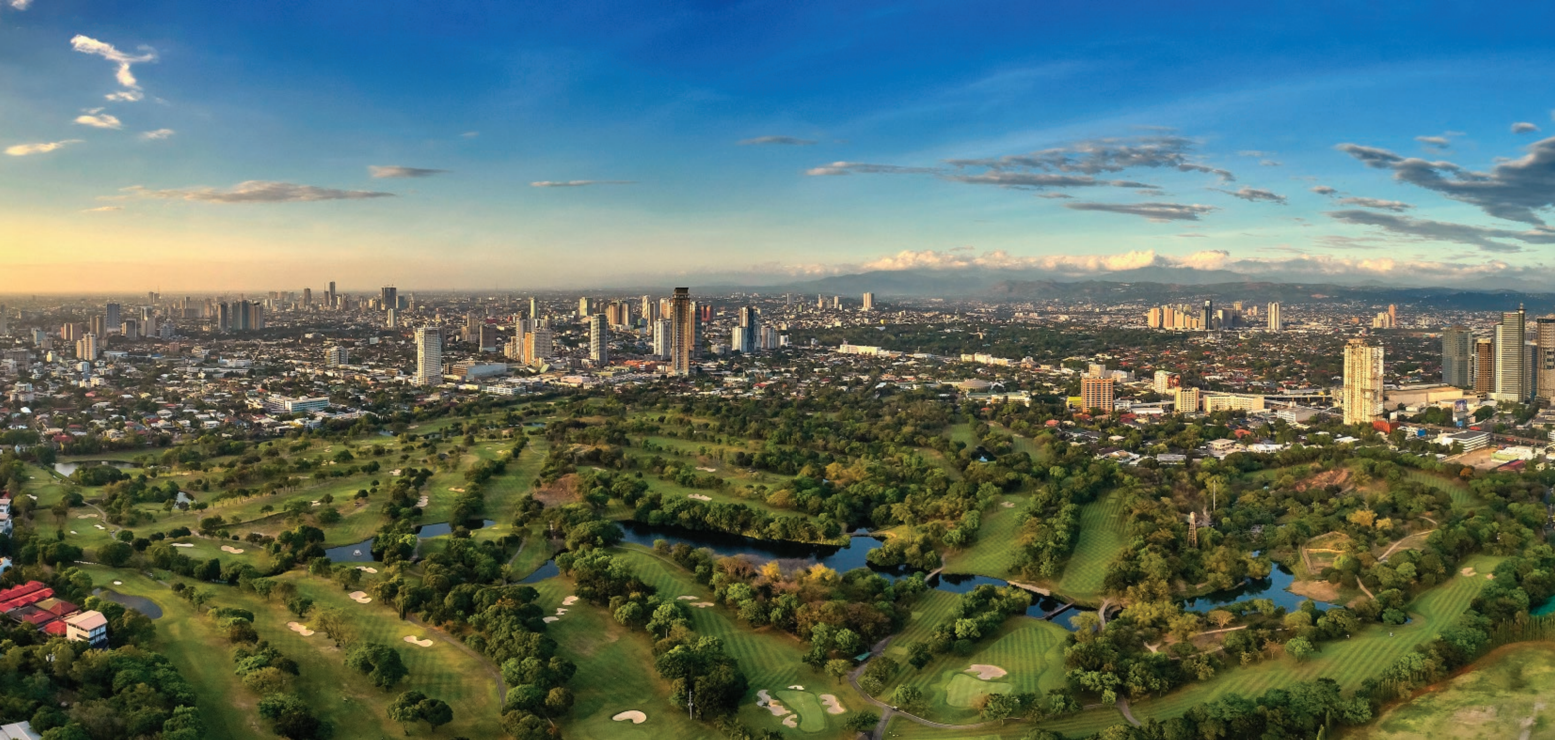
Actual photo of Wack Wack Golf & Country Club.

At the heart of the Wack Wack neighborhood and providing an exquisite backdrop to the panoramic views at Shang Residences at Wack Wack is one of the country's finest golf courses.