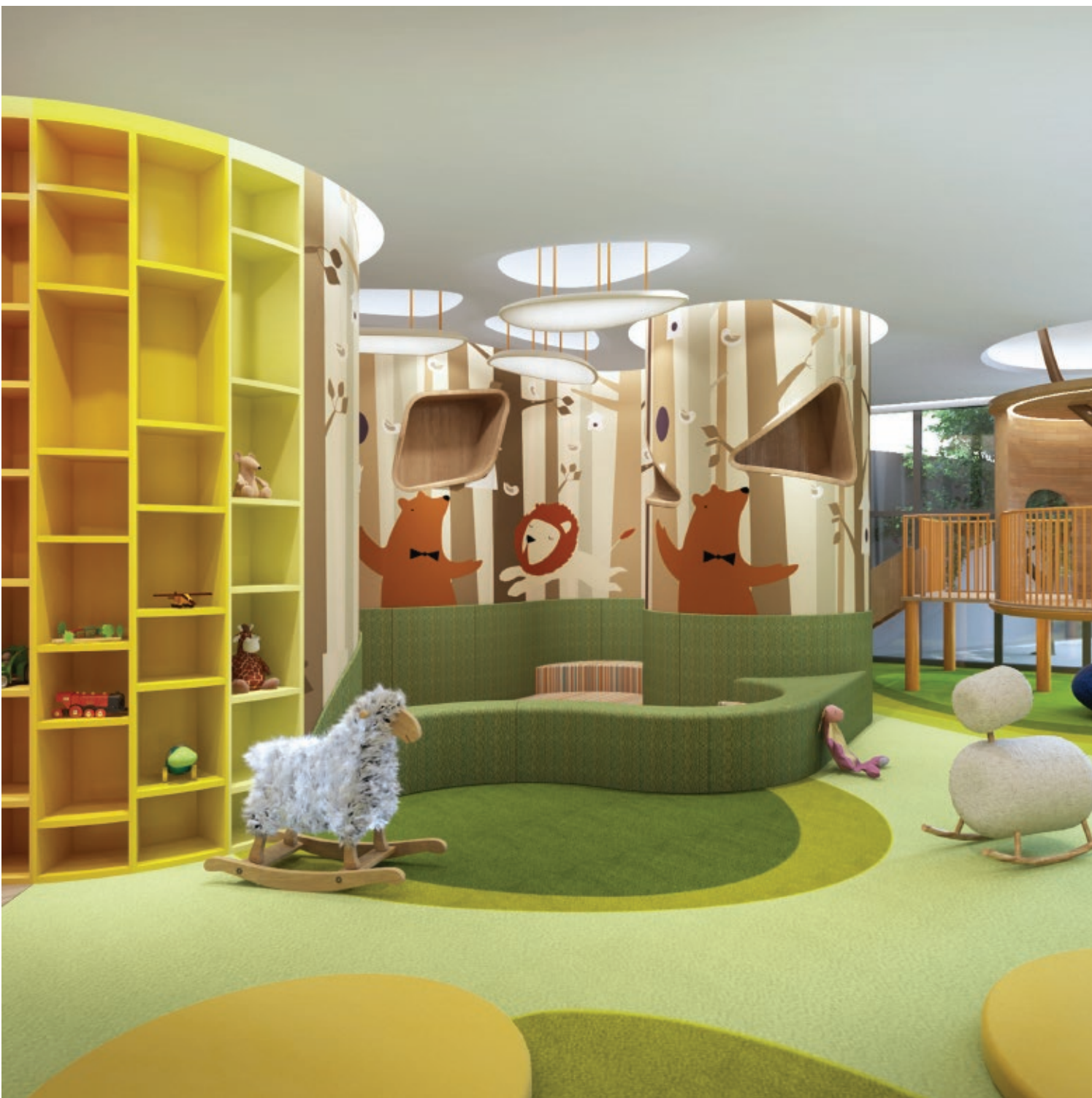
The Kids Zone. Artists' image for illustration purposes only.

Shang Residences at Wack Wack was designed with families in mind. The Kids Zone offers an exciting space for toddlers and young children to stretch their legs and explore their world.