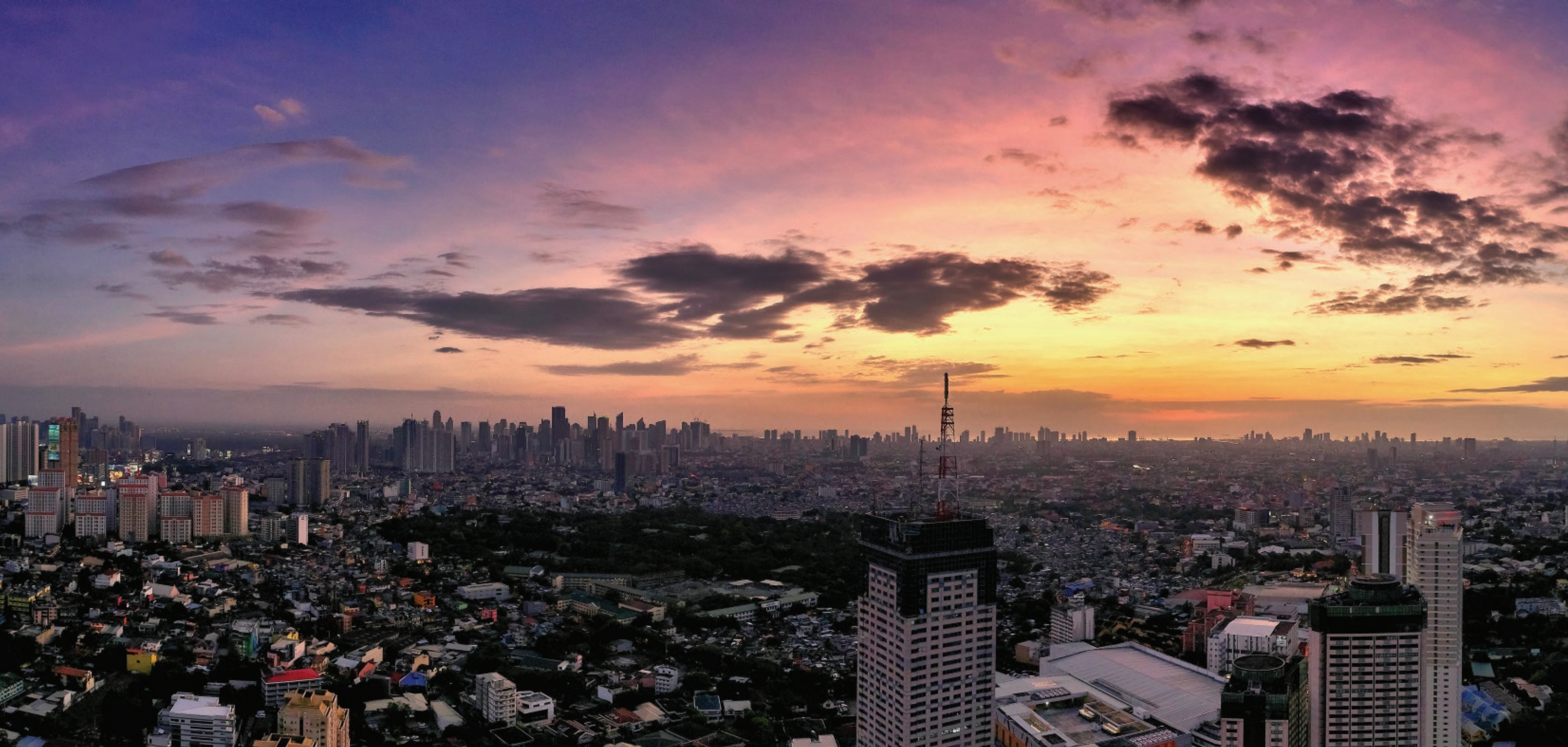
Actual photo of Makati Skyline.